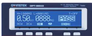
Large LCD, High Intensity Indicators and Function Keys

The 240 x 48 display clearly shows the applied voltage, test parameters, test conditions, measurement value and result on the screen at the same time. The real-time status update on the LCD display accompanied by the multi-colored LED status indicators on the front panel allow operators to have a full control of the test process to perform precision test and avoid unnecessary operation risks at the same time. The status indicator above the high voltage output terminal will automatically flash when an output is in place. In addition, the function keys arranged below the LCD display provide convenient operation that test functions can be easily changed by a single pressing.