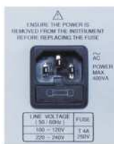
Universal Input Voltage Range

Additionally, the GPT-9600 series provides the universal input voltage range for operating equipment in countries with different electrical power standards. With the GPT-9600 series, the hustle of switching or selecting input voltage range can be left behind. Furthermore, 50Hz or 60Hz can be selected to provide a stable and appropriate test voltage without relying on the electrical environment conditions of input power so as to meet the test requirements.