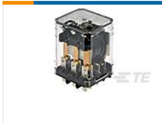
TE Part #1-1393118-2 KUP-14D15-110=KU