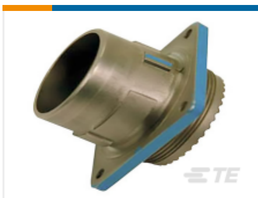
TE Part #YDIV46E15-35SCC003 PLUG ASSY