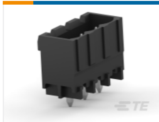
TE Part #1-2342082-5 15POS HDR ST, HT, 5.00MM PITCH, TL 2.6MM