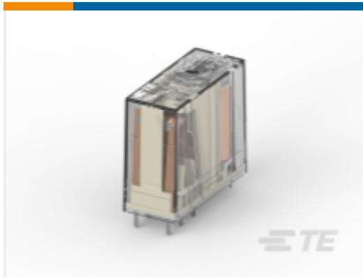
TE Part #1-1393258-5 Force Guided Power Relay, 2 Poles