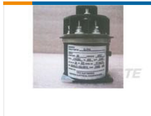
TE Part #1-1616933-6 D7PH=RELAY