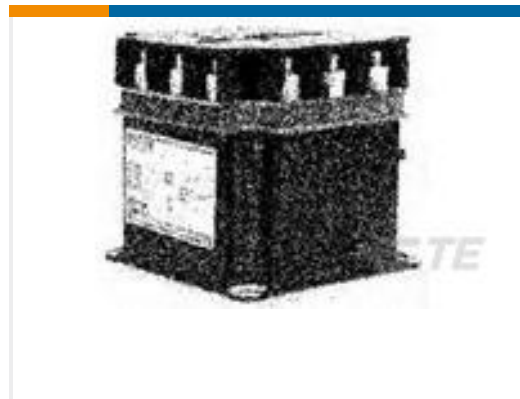
TE Part #1-1616043-0 B140V=RELAY