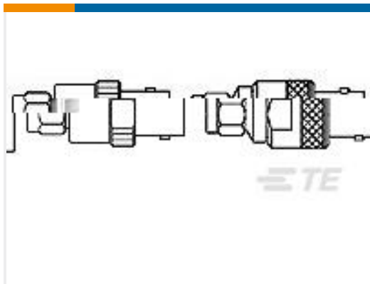
TE Part #1053786-1 2082 2320 00