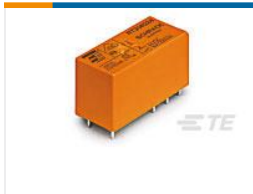
TE Part #1-1419108-7 RT424024F