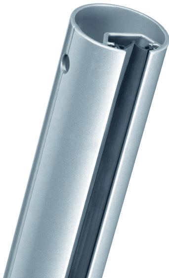
Extension tube 150 cm PFA 9003