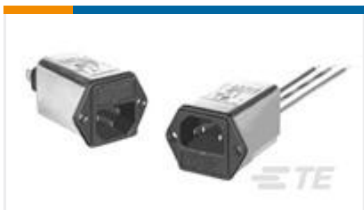
TE Part #2-6609115-2 6EGG1-1 SHORT VERS=F7382E