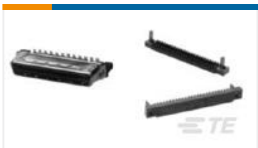
TE Part #1-5750913-7 68 50SR CABLE CONN KIT