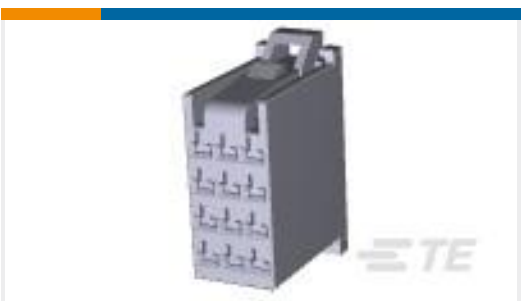
TE Part #178214-1 DYNAMIC 3400 REC HSG 12P