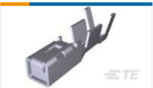
TE Part #1747498-2 DYNAMIC D4200 REC CONT L/LP