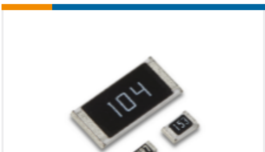
TE Part #2176347-4 CRGCO 2010 18R 1%