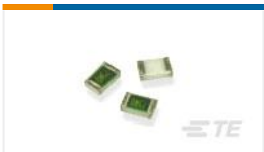
TE Part #3-2176092-4 RP 2A 0.25W 1K54 0.1% 25PPM 1K RL