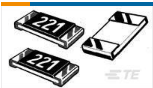
TE Part #7-2176070-5 3521 12K 1% 2W