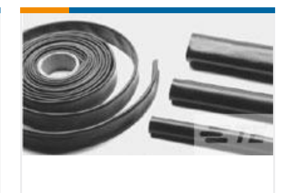
TE Part #CX1369-000 BSTS-13X4FR/NM