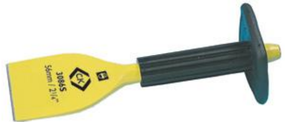
Electricians bolster with grip