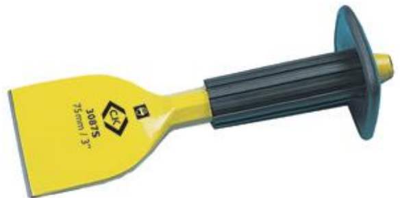
Brick bolster with grip