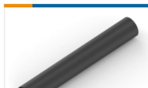
TE Part #NB18084001 RNF-100-1-1/4-BK-SP