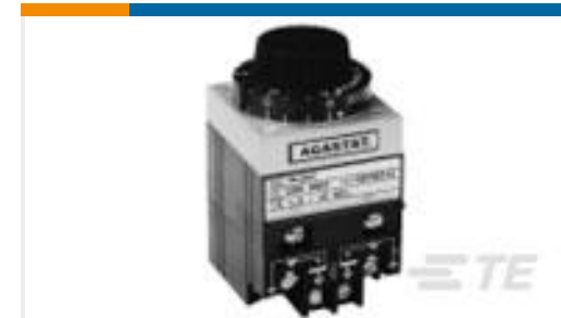
TE Part #1423157-8 7012AD=RLY,STD,ON,2P,120VAC,50