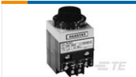
TE Part #1423162-5 7022AC=RLY,STD,OFF,2P 120VAC,1