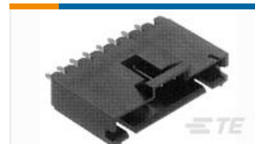
TE Part #1-103735-9 20 MTE HDR SRST LATCH .100CL