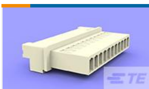
TE Part #1969588-9 HSG, REC, FREE-HANGING, SINGLE ROW, EP2.5