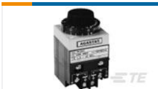
TE Part #1423159-8 7012NJ=RLY,STD,ON,2P,48VDC,12