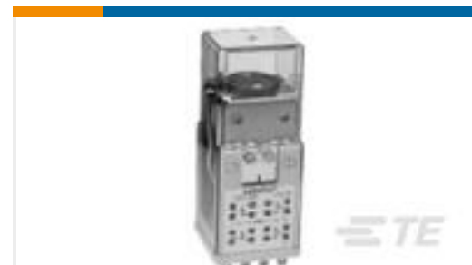
TE Part #1423155-3 GPC=RELAY,48VDC