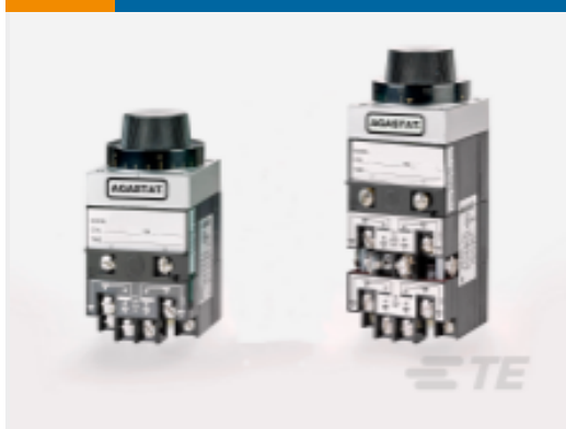
TE Part # 1423157-5 7012AC=RLY,STD,ON,2P,120VAC,15