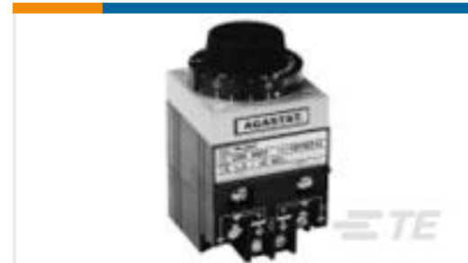
TE Part #1423157-5 7012AC=RLY,STD,ON,2P,120VAC,15