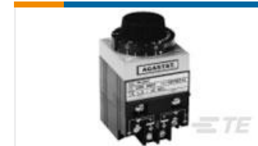
TE Part #1423160-3 7014AC=RLY,STD,ON,4P,120VAC,20