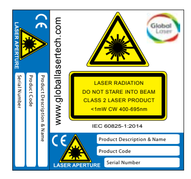
Class 2 Laser Label

Our Lasers are compliant to IEC 60825-1 2014 standards. The lasers will fall within one of the following classifications depending on power, wavelength and fan angle. An example of the labels supplied with the units are shown below.