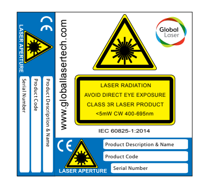
Class 3R Laser Label