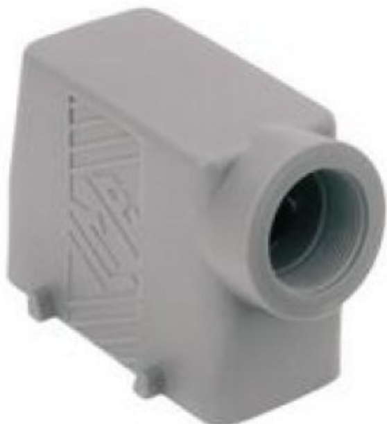
Dimensions in mm