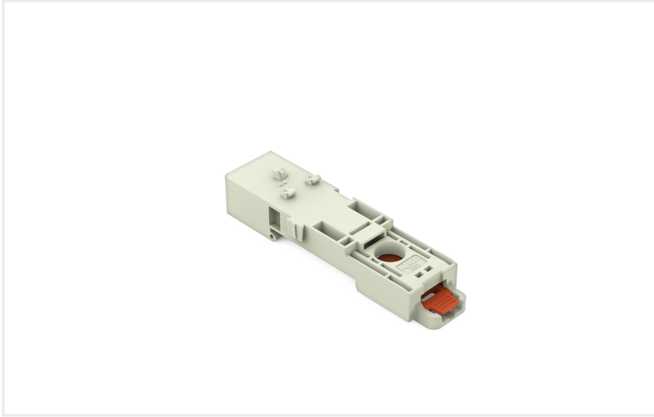
Color: ■ light gray