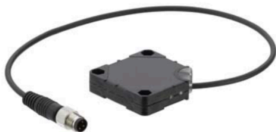
Part no.: 50135742 LCS-1Q40P-F20BNP-K020P Capacitive sensor