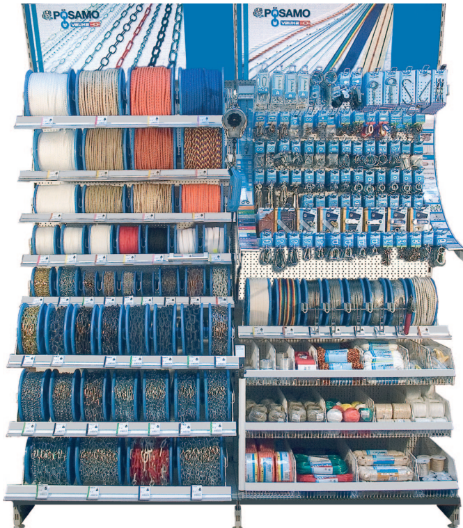
Baustein 8 = 2 x 1,00 m x 1,85 m (Werkmarkt)