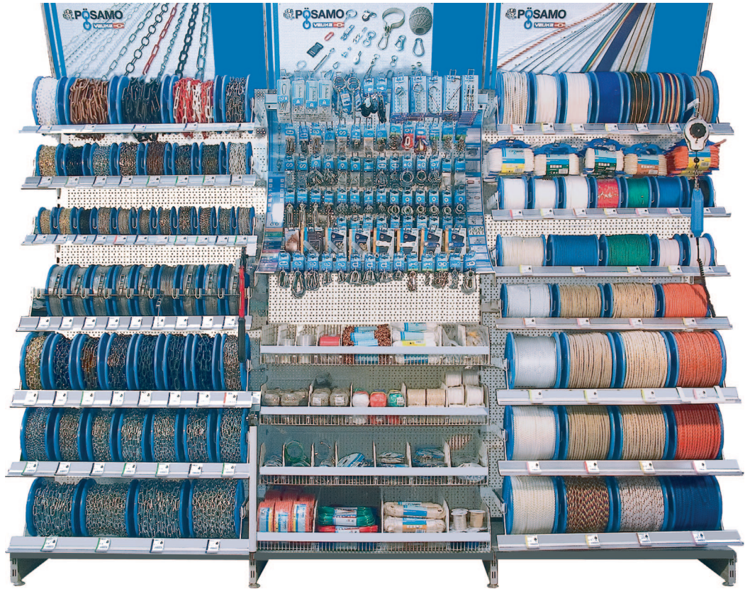
Baustein 7 = 3 x 1,00 m x Behanghöhe 1,85 m