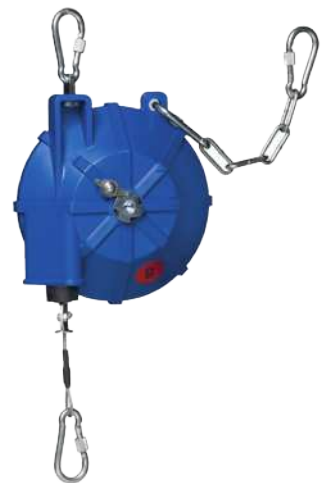
AB Model, Rear View