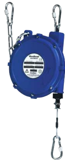
AB and ABRL Model, Front View