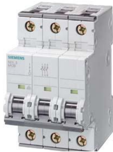
CIRCUIT BREAKER 400V 10KA, 3-POLE, A, 40A, D=70MM