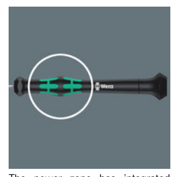
The power zone has integrated soft zones near the blade tip to ensure high torque transfer for loosening or tightening screws without losing contact with the screw.