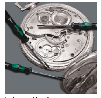
Indispensable for many users, including electronics technicians, opticians, precision engineers, jewellers, EDP hardware fitters and model-makers.