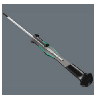
Multi-component screwdriver handle for ergonomic working.

The refined screwdriver for electronics technicians