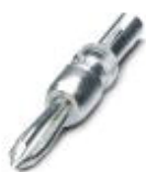
Test plugs, with solder connection up to 1 mm 2 conductor cross section, Color: silver