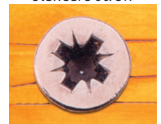
surface damage around countersunk head