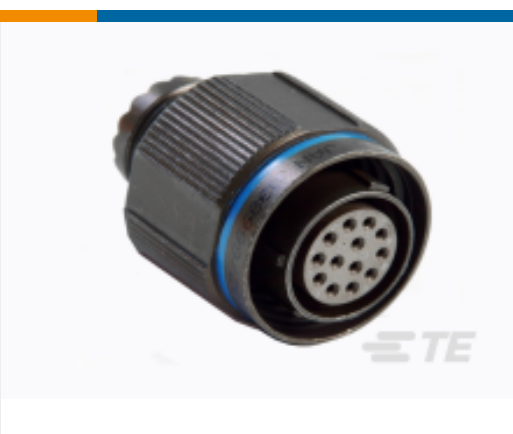
TE Part #YDTS26W21-16SAV001 PLUG ASSY