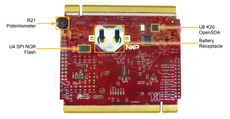
Figure 2: Back side of TWR-KM35Z75M board