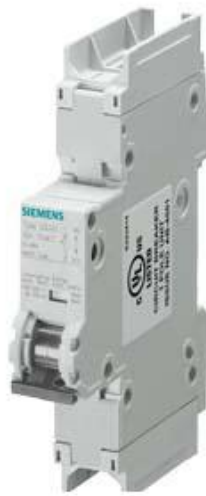
CIRCUIT BREAKER 240V 14KA, 1-POLE, C, 20A, D=70MM ACC. TO UL 489