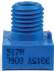
Figure 1: Original Video Ink-Jet Print

The current video ink-jet print process shown in Figure 1 is being changed to a laser print method shown in Figure 2. The laser print method provides a more permanent marking to the product that is not removable with typical cleaning solvents. The laser print marking also enhances the clarity and legibility of the print.