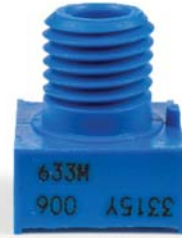
Figure 2: New Laser Print

There is no impact to fit or function of the product with this change. The only change to form is the appearance of the marking. This change notification affects all Model 3315 standard and modified-standard parts, and any new Model 3315 part numbers that are available following this notification. A list of active affected part numbers can be found in Table 1.