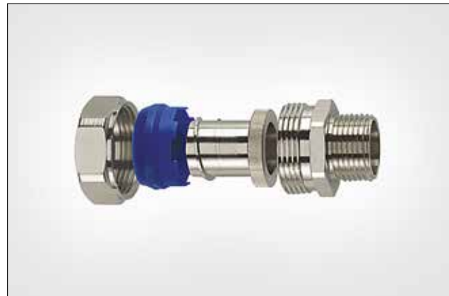
HeliaGuard PCS-FMC Compression Fitting.

i Fittings with PG and swivel threads are also available. For our complete range of conduits and fittings, please see our HeliaGuard catalogue.