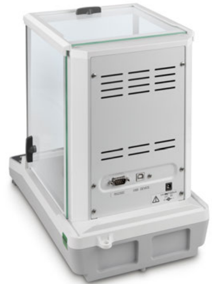
KERN ACS/ACJ with standard data interface RS-232 and USB

The bestseller in analytical balances, with high-quality single-cell weighing system, also with EC type approval [M]