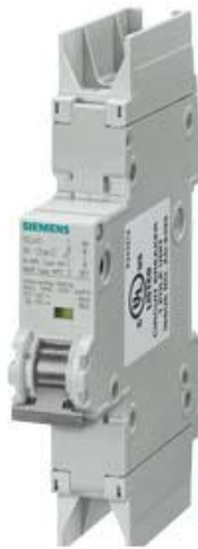
CIRCUIT BREAKER 10KA, 1POLE, D, 20A ACC. TO UL 489 - 277V