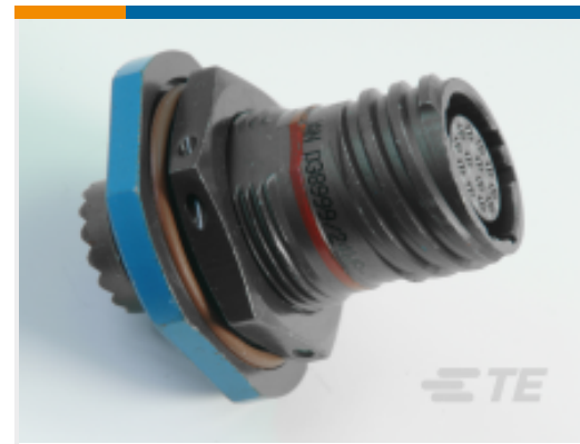
TE Part #ZPF00000000016570 DTS 24 F 11-98 SN