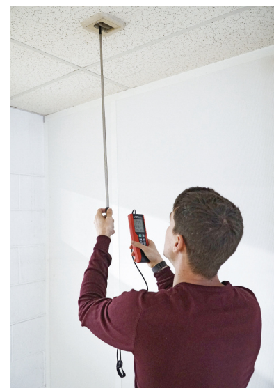
SEFRAM 9862 telescopic rod