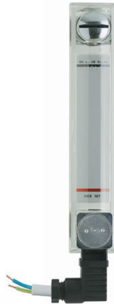
ELESa Original design