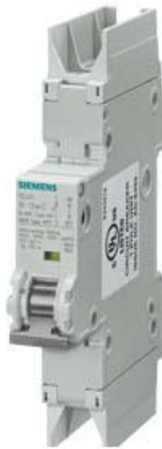
CIRCUIT BREAKER 10KA, 1POLE, C, 13A ACC. TO UL 489 - 277V