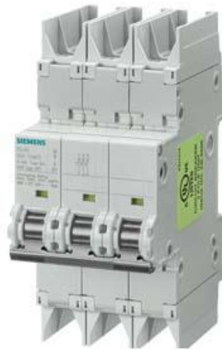
CIRCUIT BREAKER 10KA, 3POLE, D, 16A ACC. TO UL 489 - 480Y/277V