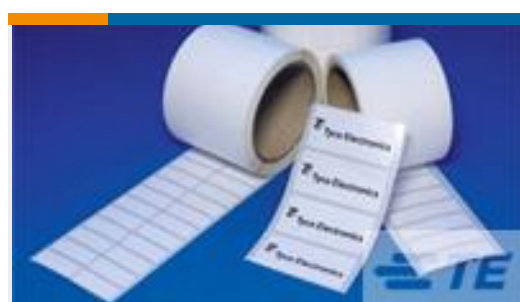
TE Part # 3-1768018-5 EET-1113P-9