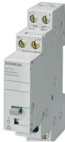
REMOTE SWITCH WITH 2 NO CONTACT FOR AC 230, 400V 16A CONTROL DC 24V