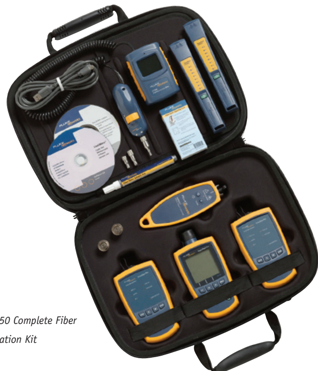
FKT1450 Complete Fiber Verification Kit