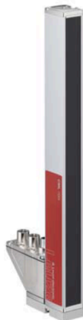
Figure can vary

Part no.: 50131741 CML730i-R05-560.R/PN-M12 Light curtain receiver