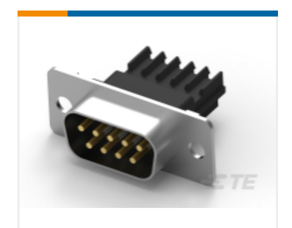
TE Part # CAT-AM7-248H3 IDC D-Sub: Plug Assembly, Wire to Wire, Signal, 2.77 mm