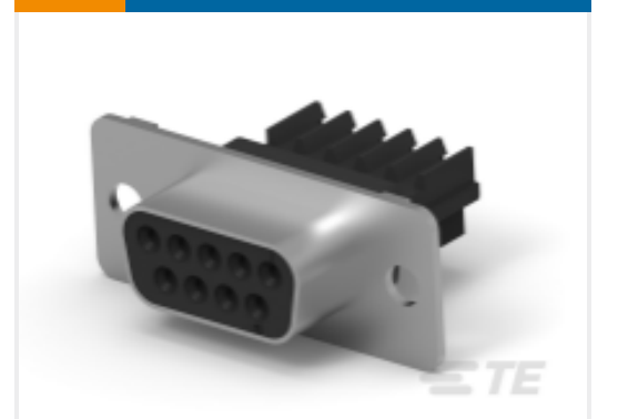
TE Part # CAT-AM7-248H8 IDC D-Sub: Receptacle Assembly, Wire to Wire, Signal, 2.74 mm