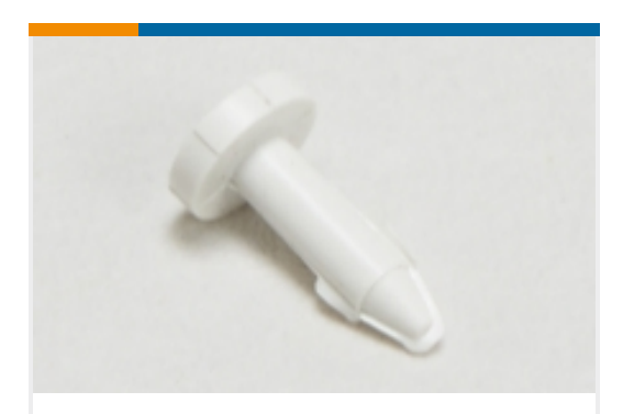
D-Sub Contact Accessories(1)