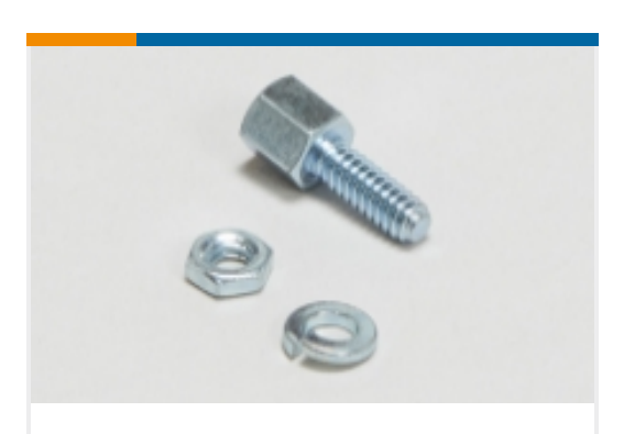
D-Sub Locking & Mounting(122)