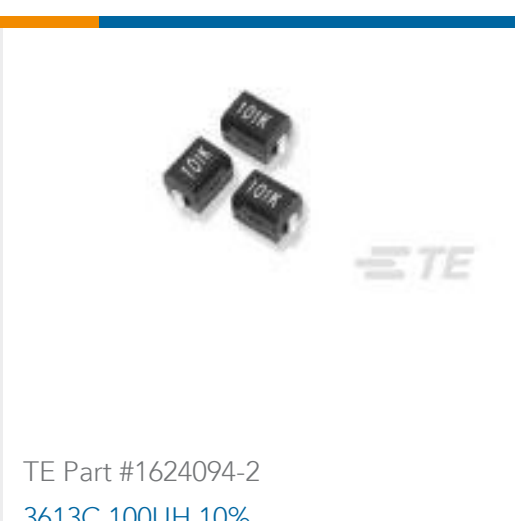
3613C 100UH 10%