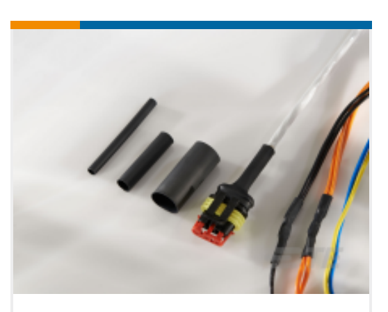
TE Part #EH2289-000 DWFR-6/2-0-STK

D-Sub Connector Contacts: Pin, Brass, Signal, Size 20