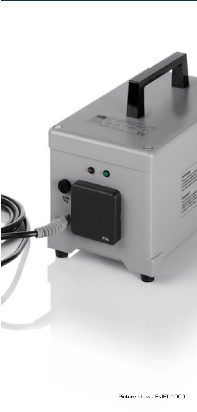
Picture shows E-JET 1000