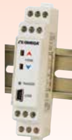
TXDIN1610 universal DIN rail transmitter.