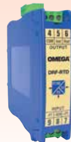
DRF-RTD DIN rail mountable signal conditioner.