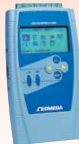
OM-DAQPRO-5300 handheld data logger.