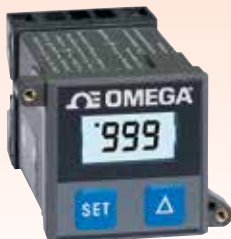
CN1A-TC temperature controller.