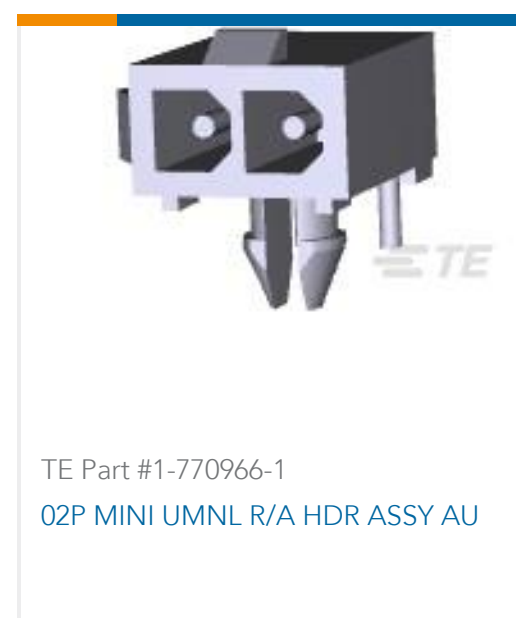
TE Part #1-770966-1 02P MINI UMNL R/A HDR ASSY AU