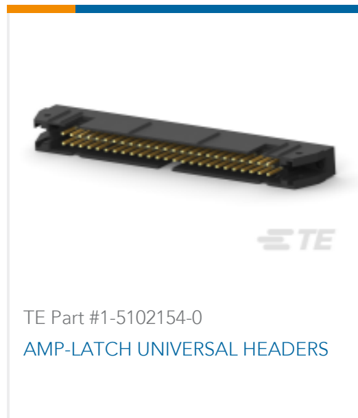
TE Part #1-5102154-0 AMP-LATCH UNIVERSAL HEADERS