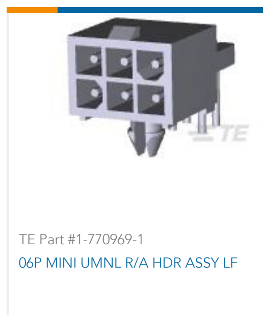
TE Part #1-770969-1 06P MINI UMNL R/A HDR ASSY LF