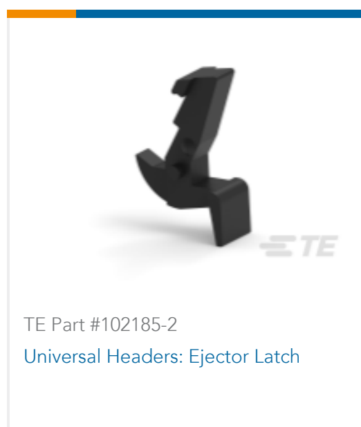
TE Part #102185-2 Universal Headers: Ejector Latch