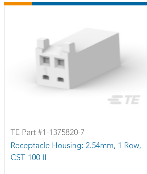
TE Part #1-1375820-7 Receptacle Housing: 2.54mm, 1 Row, CST-100 II