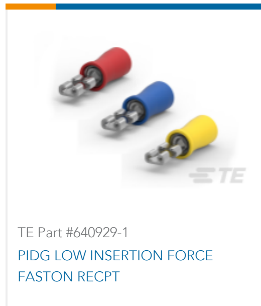
TE Part #640929-1 PIDG LOW INSERTION FORCE FASTON RECPT