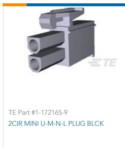
TE Part #1-172165-9 2CIR MINI U-M-N-L PLUG BLCK