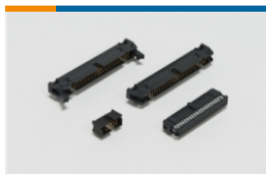
Ribbon Cable Connectors(525)