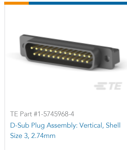
TE Part #1-5745968-4 D-Sub Plug Assembly: Vertical, Shell Size 3, 2.74mm