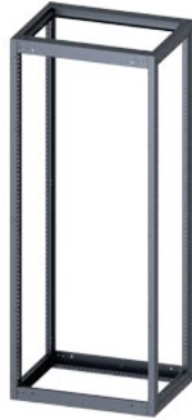
SIVACON, Supporting structure, for standard Empty enclosure, H: 2000 mm, W: 800 mm, T: 600 mm, zinc-plated