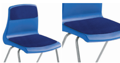
Seat & Back Pad SBP