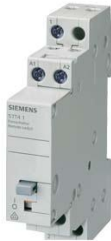
REMOTE SWITCH WITH 1 NO CONTACT FOR AC 230V 16A CONTROL DC 24V