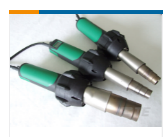
TE Part # EG1116-000 CV1981-ST-230V1600W-UK