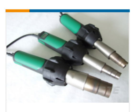
TE Part # EG1118-000 CV1981-ST-120V1600W-US