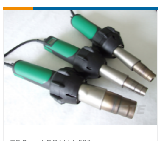
TE Part # EG1114-000 CV1981-ST-230V1600W-EU