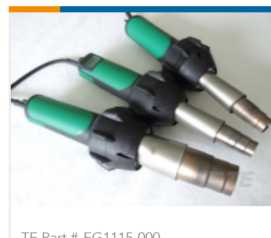
TE Part # EG1115-000 CV1981-ST-230V1600W-CH