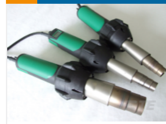
TE Part # EG1120-000 CV1981-ST-120V1600W-UK