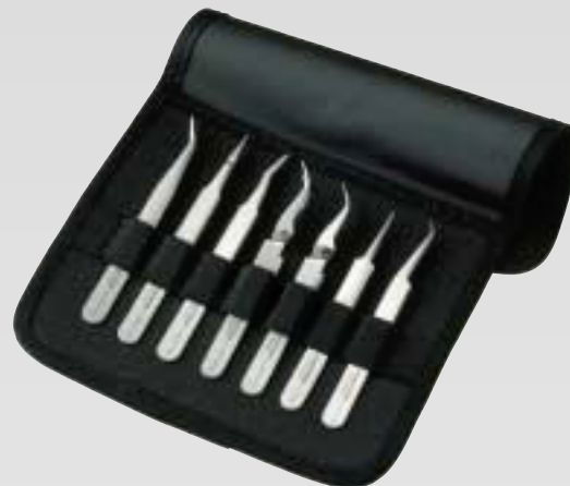
SMD tweezer set, 7 pcs

Since 1856, Lindstrom has developed and refined precision hand tools to perfection. Our tweezers offer optimal balance, tip alignment, and symmetry as well as a wide variety of materials and designs to meet the most sophisticated and demanding requirements.