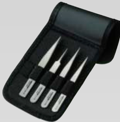
Titanium tweezer set, 4 pcs