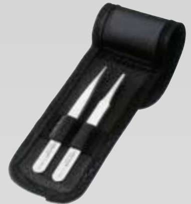
Strong tip tweezer set, 2 pcs