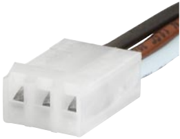
Wire Harness Wire harness for SCHURTER products