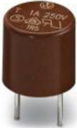
Replacement fuse, for INTERBUS-ST modules

Please be informed that the data shown in this PDF Document is generated from our Online Catalog. Please find the complete data in the user's documentation. Our General Terms of Use for Downloads are valid ( http://phoenixcontact.com/download )