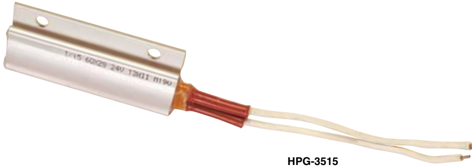
HPG-3515 shown smaller than actual size.