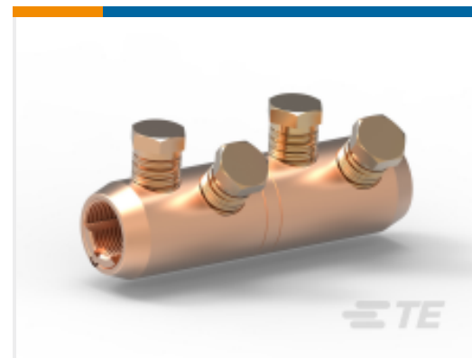
TE Part #1974136-1 Copper Shear Bolt Splices up to 35 kV