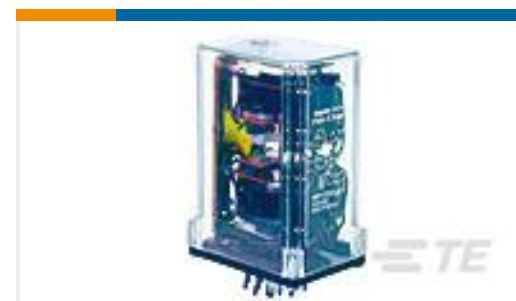
TE Part #2-1393100-3 KBP-11A-120=KA/KB/KC/KR