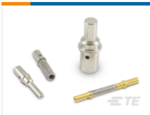
TE Part #0462-209-16141 DEUTSCH SOLID CONTACTS