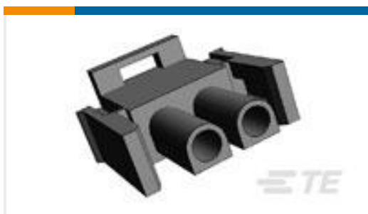
TE Part #1-480698-0 02P UMNL PLUG HSG NATL