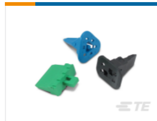
TE Part #W6P DEUTSCH DT WEDGELOCKS