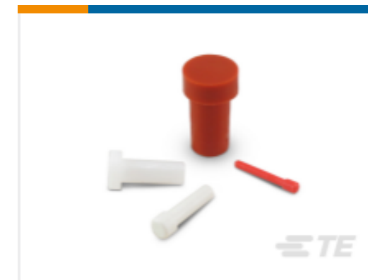
TE Part #114017-ZZ DEUTSCH SEALING PLUGS