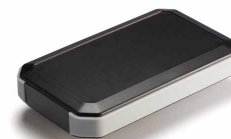
B= Black rubber corners