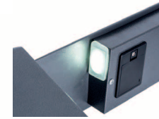
LED INTERNAL LIGHT (ED LOCK VERSION ONLY)