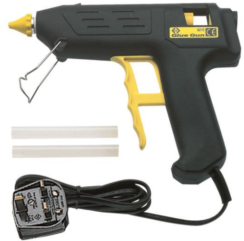
6215 (UK Plug)