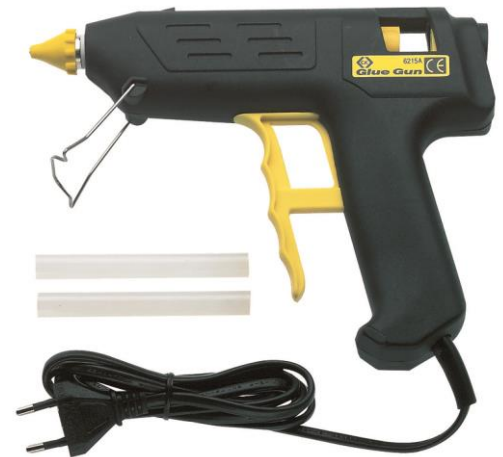
6215A (Euro plug)