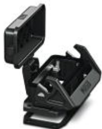
HEAVYCON EVO panel mounting base, plastic, B16, with single locking latch, height: 30.5 mm, with flat gasket, with protective cover

Please be informed that the data shown in this PDF Document is generated from our Online Catalog. Please find the complete data in the user's documentation. Our General Terms of Use for Downloads are valid ( http://phoenixcontact.com/download )